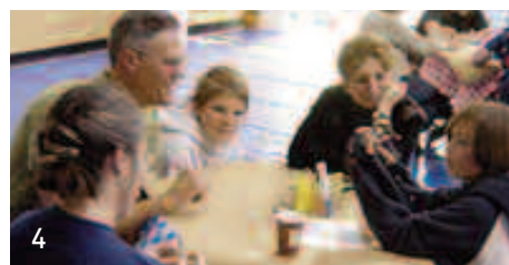
1. Dharma Drum Meditation Center, Taiwan. 2. Mother and Child at World Café. 3. Girl Scouts at MultiGen Strategy Café. 4. Future of Education Café CA. 5. MultiGen Dialogue Graphics. 6. Taiwan Children’s Café. 7. World Café Latin America MultiGen.

bringing multi-generational and multi-stakeholder voices to bear on critical issues using powerful architectures of engagement that can enable people of all ages and stages of life to foster both collective wisdom and compassionate action for the common good.